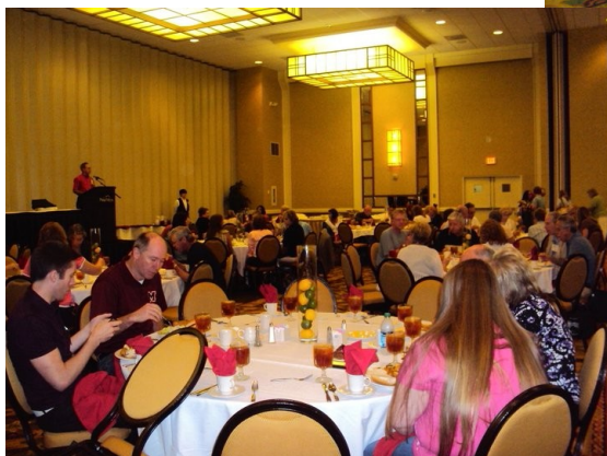
Saturday's luncheon was sponsored by Southern Optical/Essilor